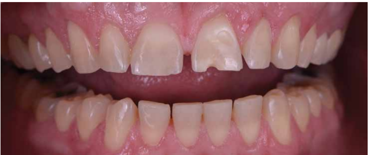
Figure 5: Initial intraoral image.