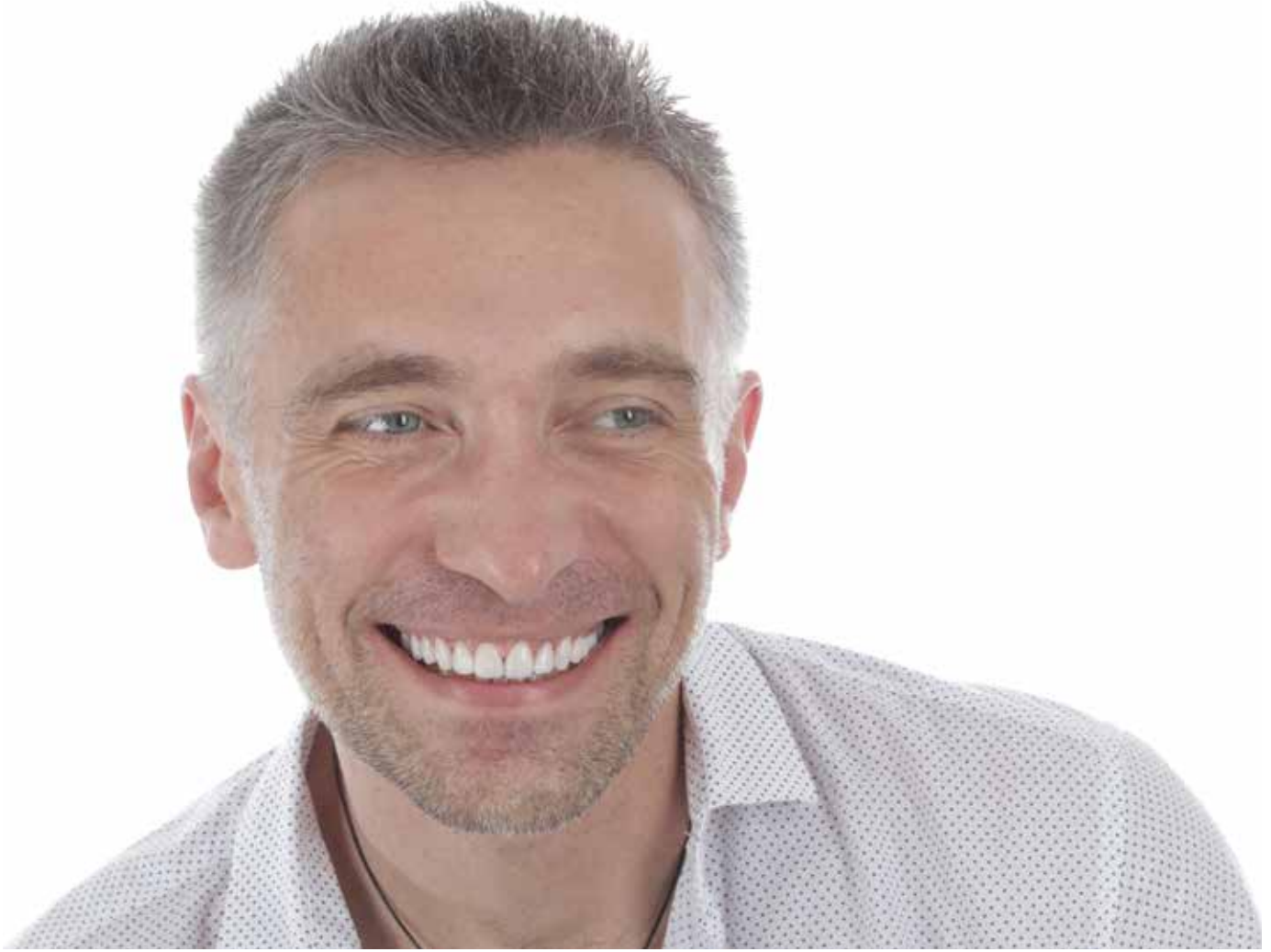
Figure 27: Final new smile.