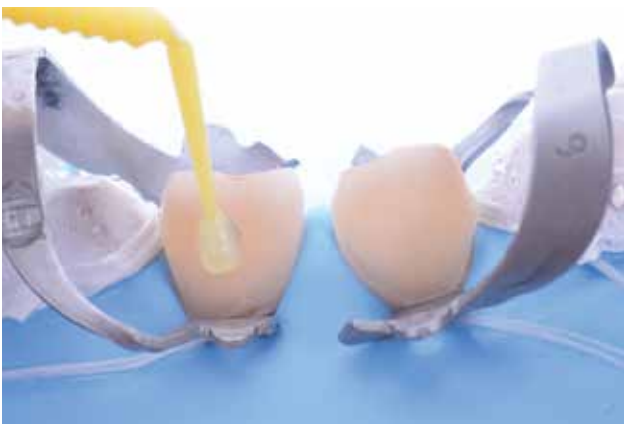
Figure 20: Applying adhesive.