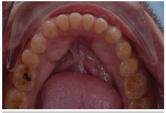
Figure 14: Preparation of the lower jaw.