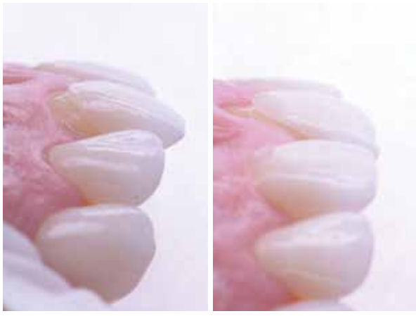
Figures 16 & 17: Try-in.