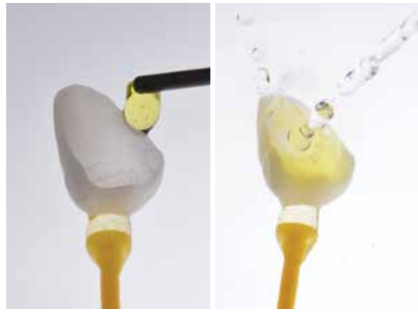
Figures 18 & 19: Etching and rinsing a portion of the restoration.