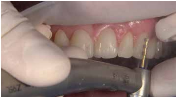
Figure 11: Preparation with the APT technique.