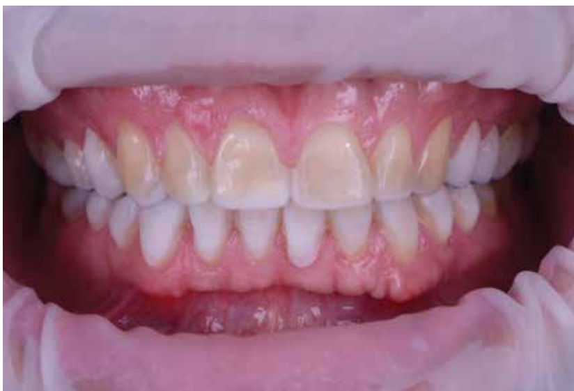
Figure 8: Functional mock-up.