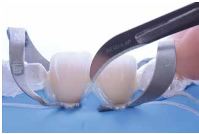
Figure 21: Eliminating excess material with a blade.