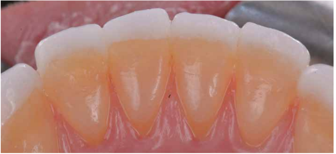
Figure 26: Adaptation of the veneers.