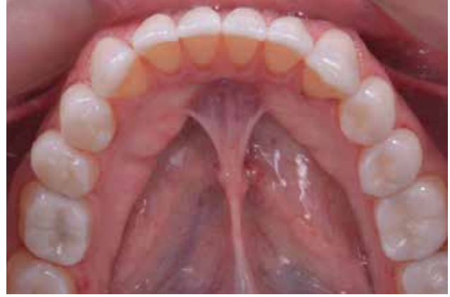
Figure 23: Final lower jaw.