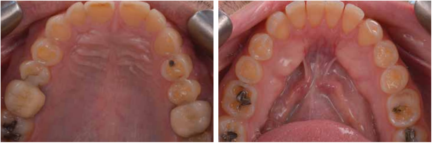
Figures 2 & 3: Initial upper and lower occlusal views showing severe erosion.