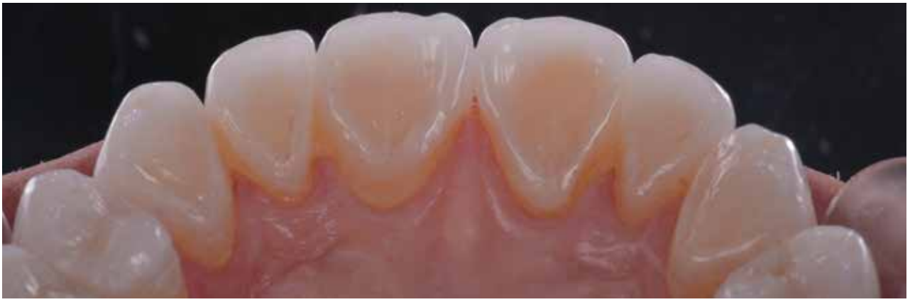
Figure 24: Palatal face.