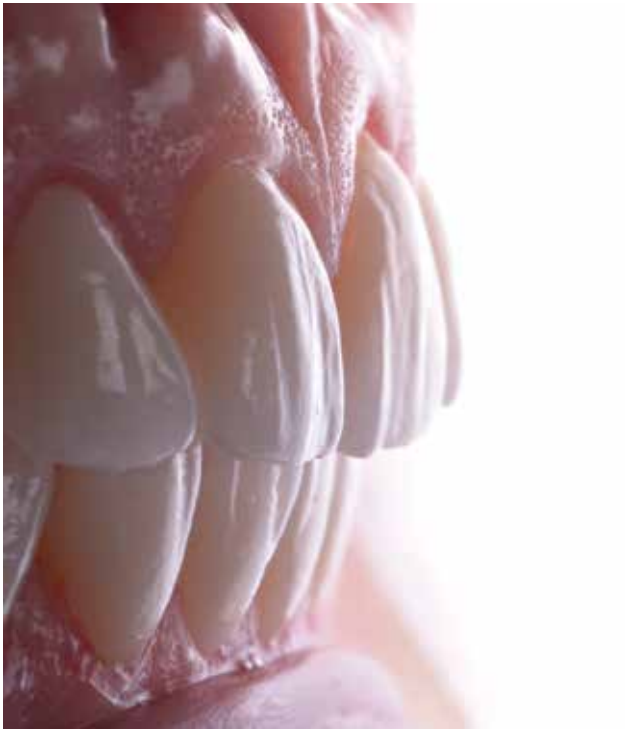
Figure 25: Texture.

_____ The teeth were not prepared in any way. _____