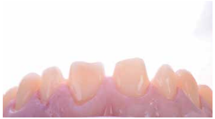
Figure 12: Preparation of the anteriors.