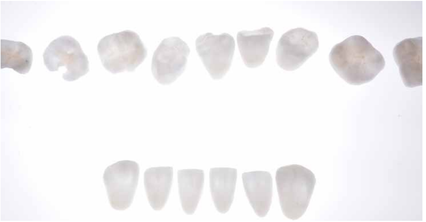
Figure 15: Milled restorations.