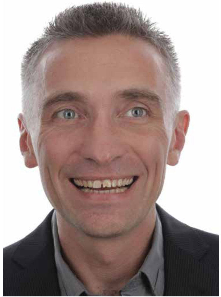
Figure 1: Initial full-face image.

The patient stated that he had neither muscle spasms nor articular pain but did have increasing discomfort during mastication and constantly tried to find a comfortable mandible position (he was unable to do so because of faulty proprioceptive feedback due to the severe tooth erosion).