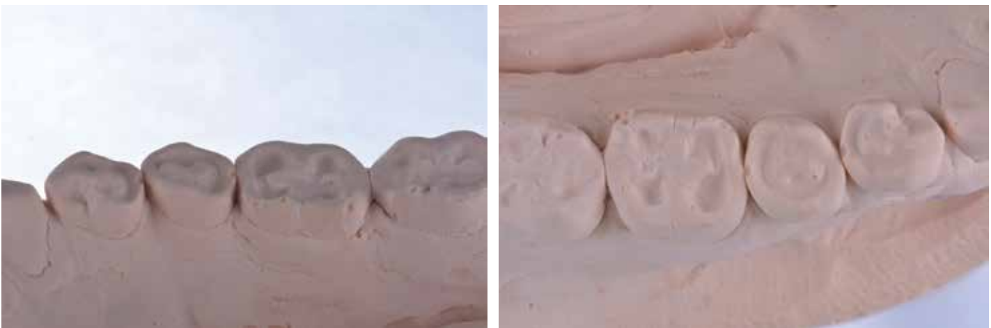
Figures 4a & 4b: Study models showing the severe wear.