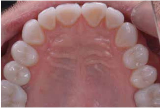
Figure 22: Final upper jaw.