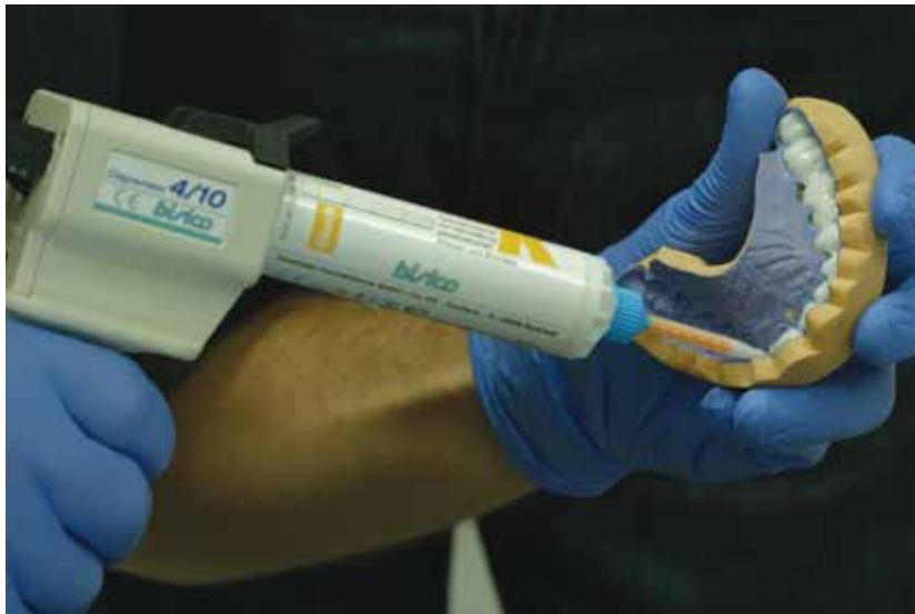
Figure 7: Preparing the mock-up.