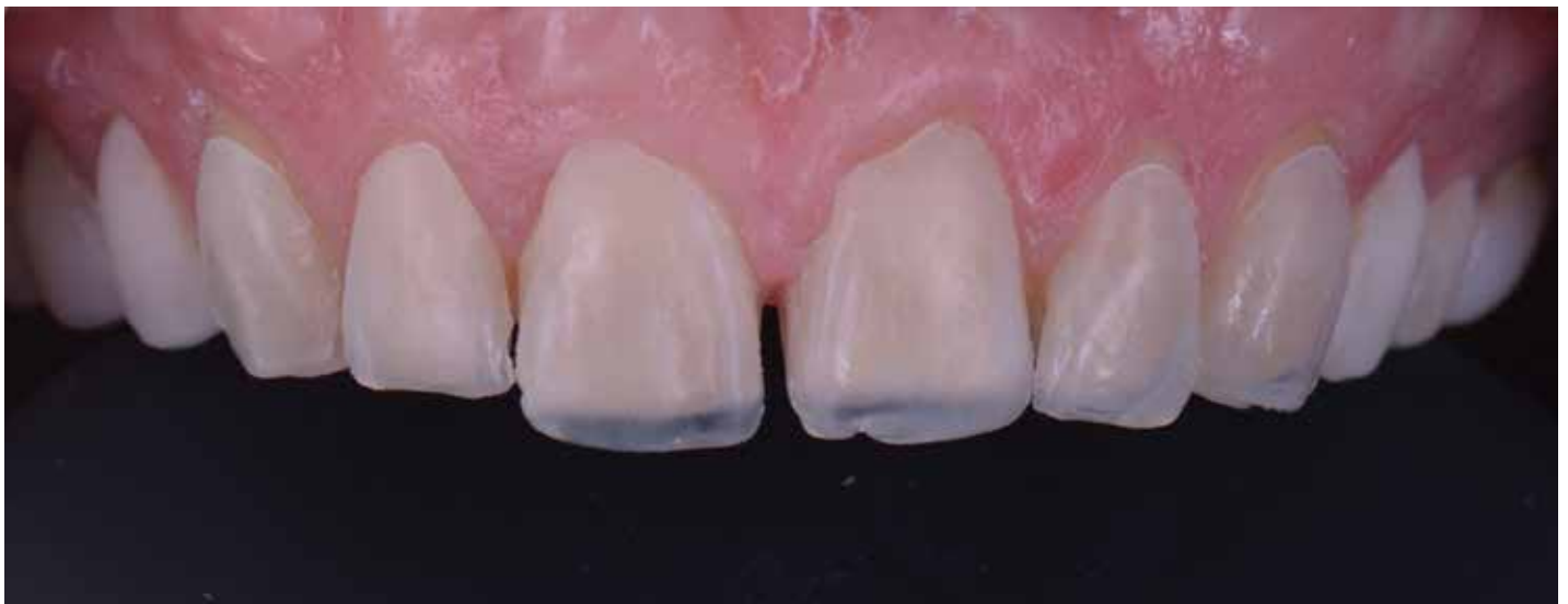
Figure 10: Skyn mock-up.