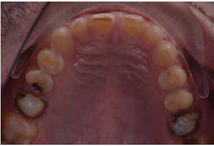
Figure 13: Preparation of the upper jaw.